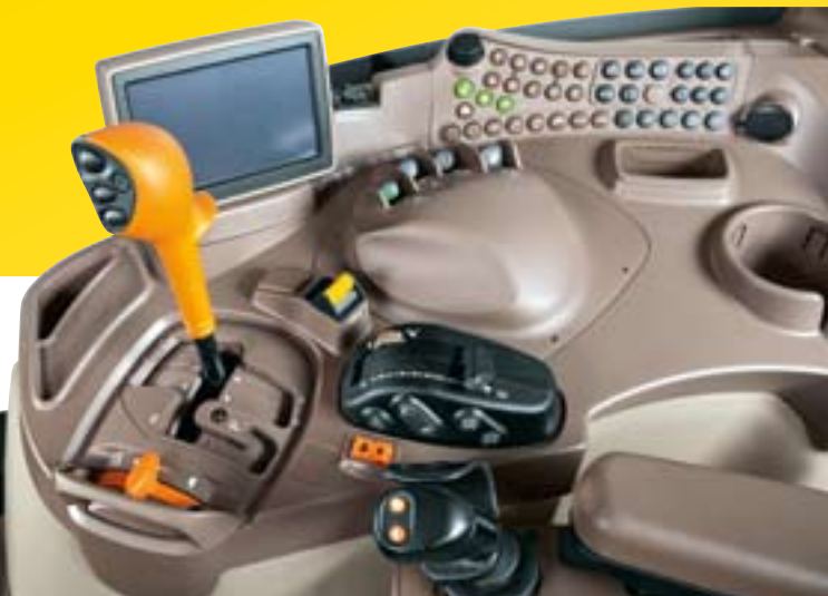
AutoQuad/PowrQuad console Optimal transmission control is within easy reach.