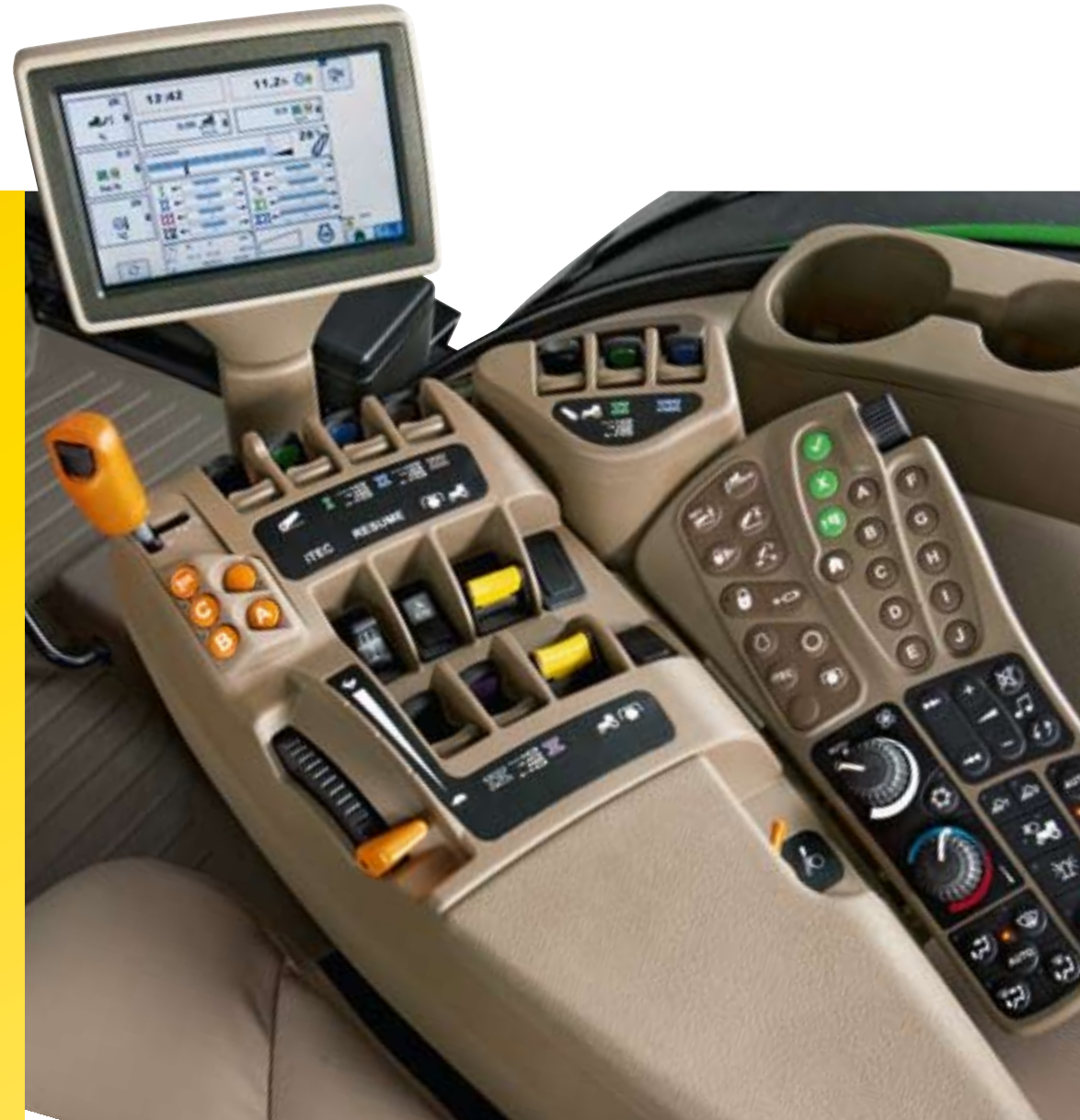
The new CommandArm console Enjoy fingertip control of the main tractor and cab functions. Use the CommandCenter display to operate AMS functions like AutoTrac, optionally available with a touch screen and video function.

*7R Series tractors equipped with PowrQuad or AutoQuad transmissions come with a different right-hand control console